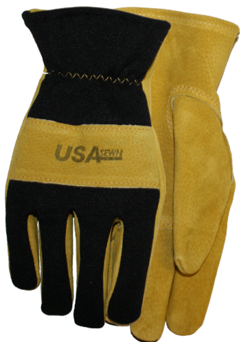
Smooth Grain Pigskin Leather Gloves (3-Pack)