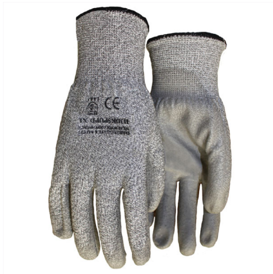
Carolina Salt & Pepper Cut Resistant Gloves (3-Pack)