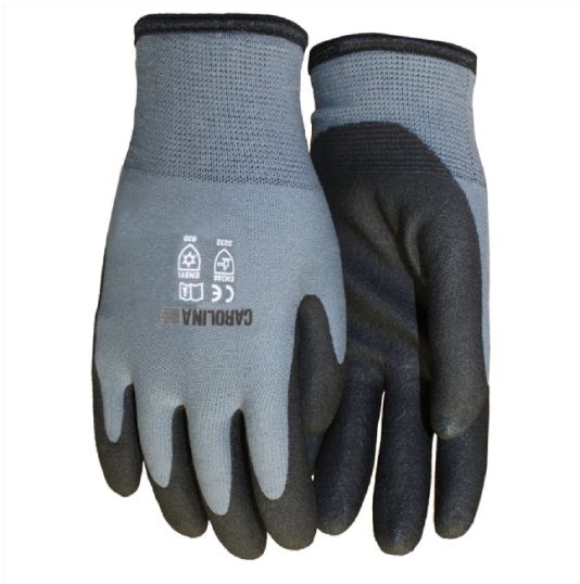
Carolina Arctic Grey Cut Resistant HPT Gloves (3-Pack)